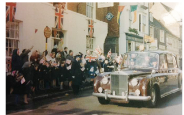
Our present Queen and Prince Philip visited Battle and Hastings in 1966 to mark the 900th anniversary of the battle