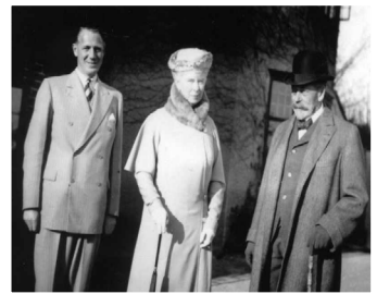
Queen Mary visited Battle Abbey and Crowhurst Park in the early 1930s