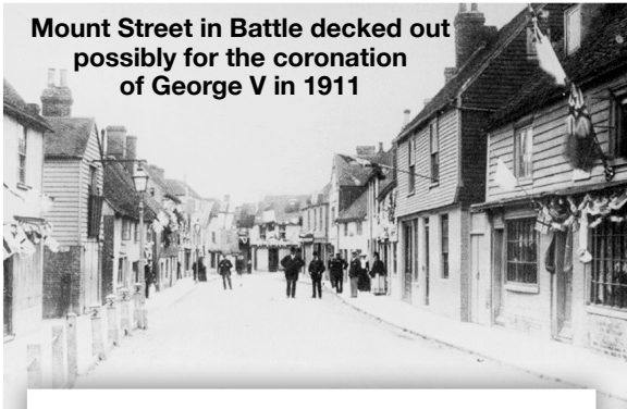
Mount Street in Battle decked out possibly for the coronation of George V in 1911

King Miguel of Portugal was displaced at home, and lived in Starrs Green House in Battle from 1848 to 1851.