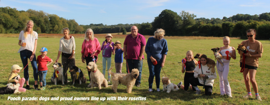
Pooch parade: dogs and proud owners line up with their rosettes