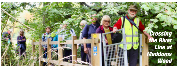
Crossing the River Line at Maddoms Wood