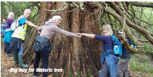
Big hug for historic tree

Foragers picked parasol mushrooms and sloe berries for later consumption.