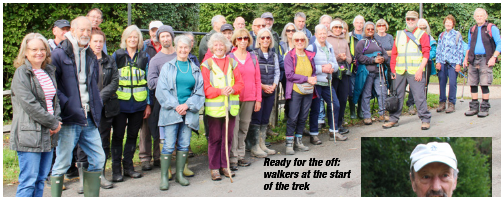
Ready for the off: walkers at the start of the trek