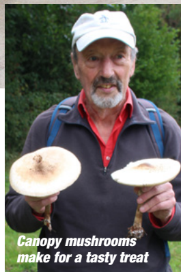
Canopy mushrooms make for a tasty treat

More than thirty walkers took advantage of a rare break in the mid-September rainfall to get up close and personal with the beautiful countryside surrounding the village.