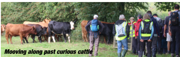
Mooving along past curious cattle