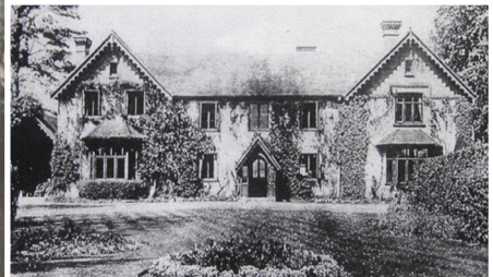
Left, the family in the garden of Leeford (pictured above)

Young voices return to Leeford – next page